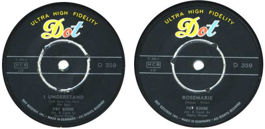
Danish release with picture cover

0907 Boone, Pat I understand (just how you feel)/Rosemarie Dot 16598 (US) 1.1964 1088 Boone, Pat I understand (just how you feel)/Rosemarie Dot 16598 (DK) 1.1964