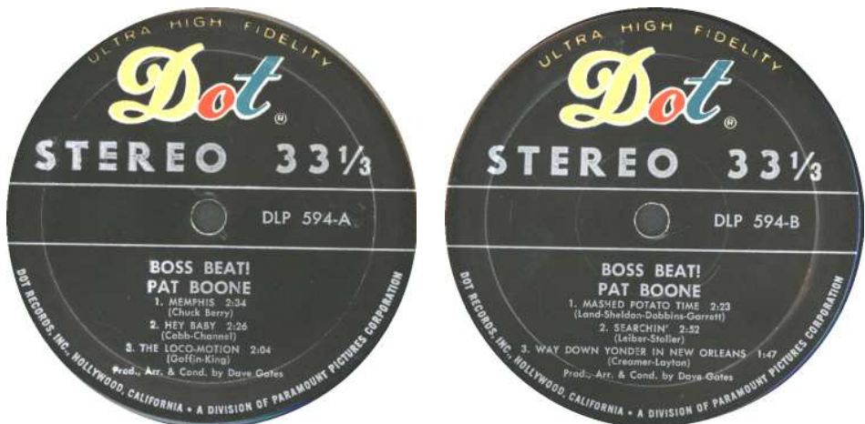
The regular album-cover was also used for this 6-track mini-juke-box-album 33 1/3