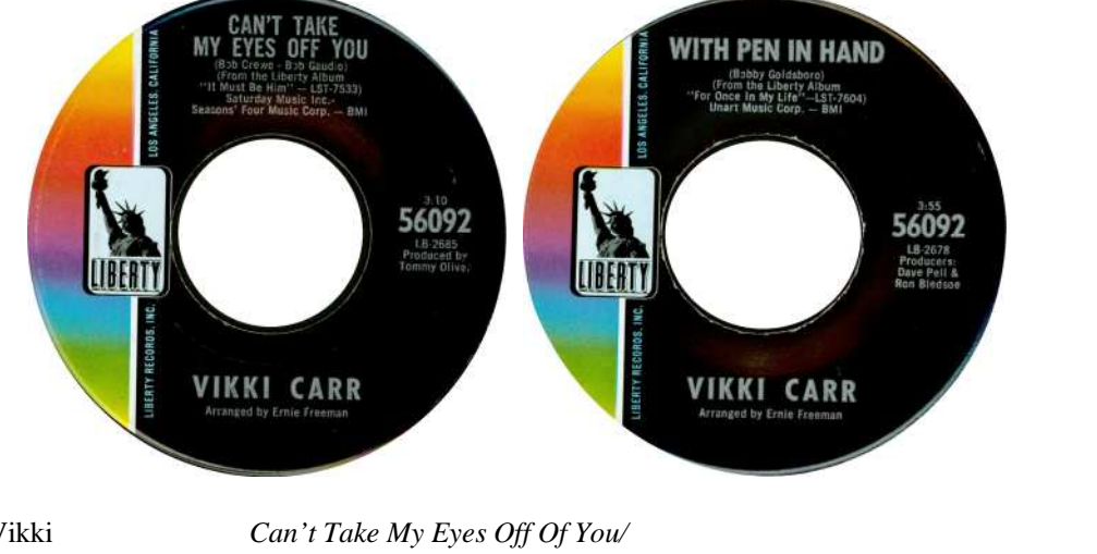
1079 Carr, Vikki