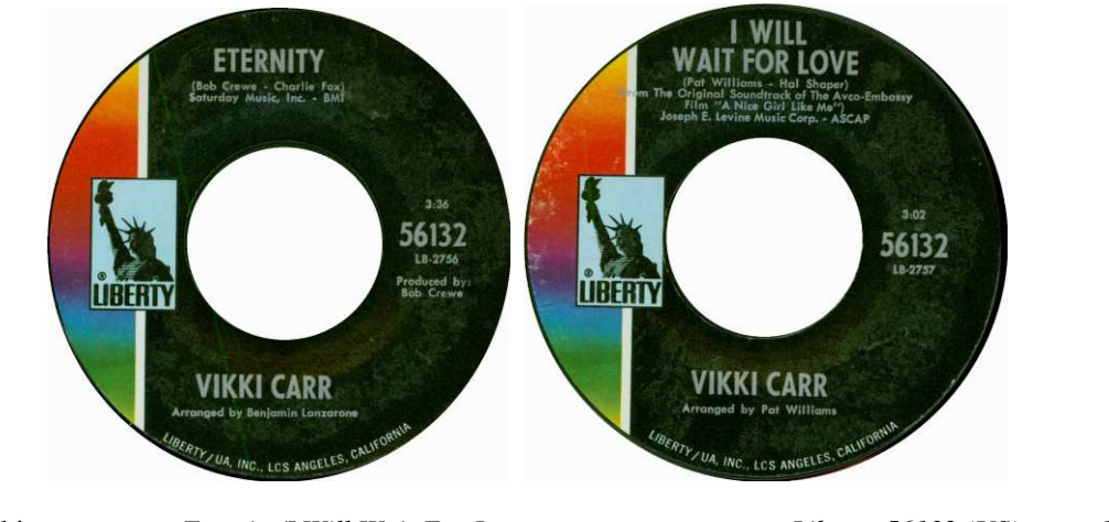
1208Carr, VikkiEternity/I Will Wait For LoveLiberty 56132 (US)1969