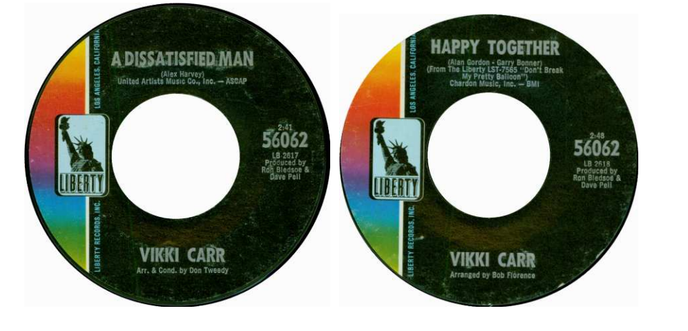
1221 Carr, Vikki A Dissatisfied Man/Happy Together Liberty 56062 (US) 1968