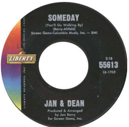
Honolulu Lullu/ Someday (You'll Go Walking By)