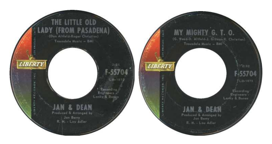
The Little Old Lady from Pasadena/ My Mighty GTO