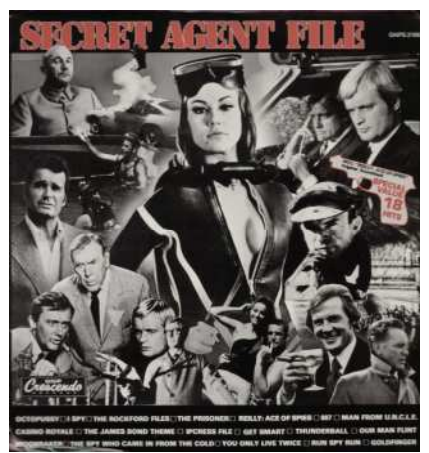
The original release and the 1984 re-issue of the album